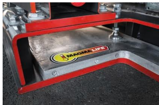
Heats up nearly 60 % quicker – unique MAGMALIFE heating system.