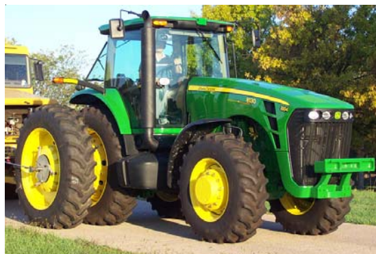
JOHN DEERE 8130 DIESEL